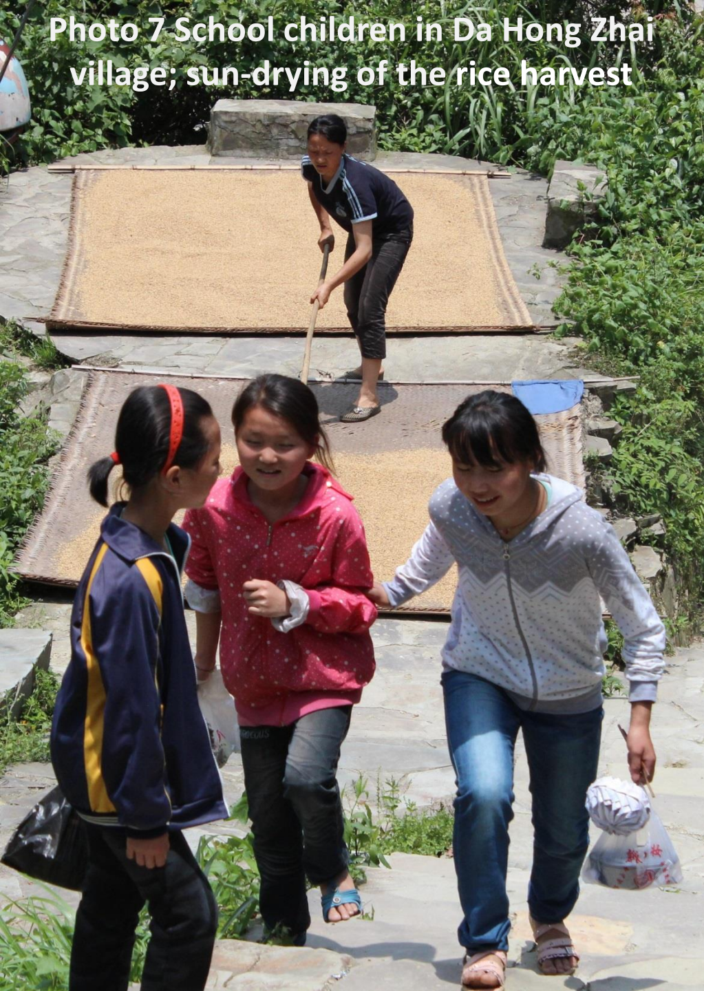
Photo 7 School children in Da Hong Zhai village; sun-drying of the rice harvest