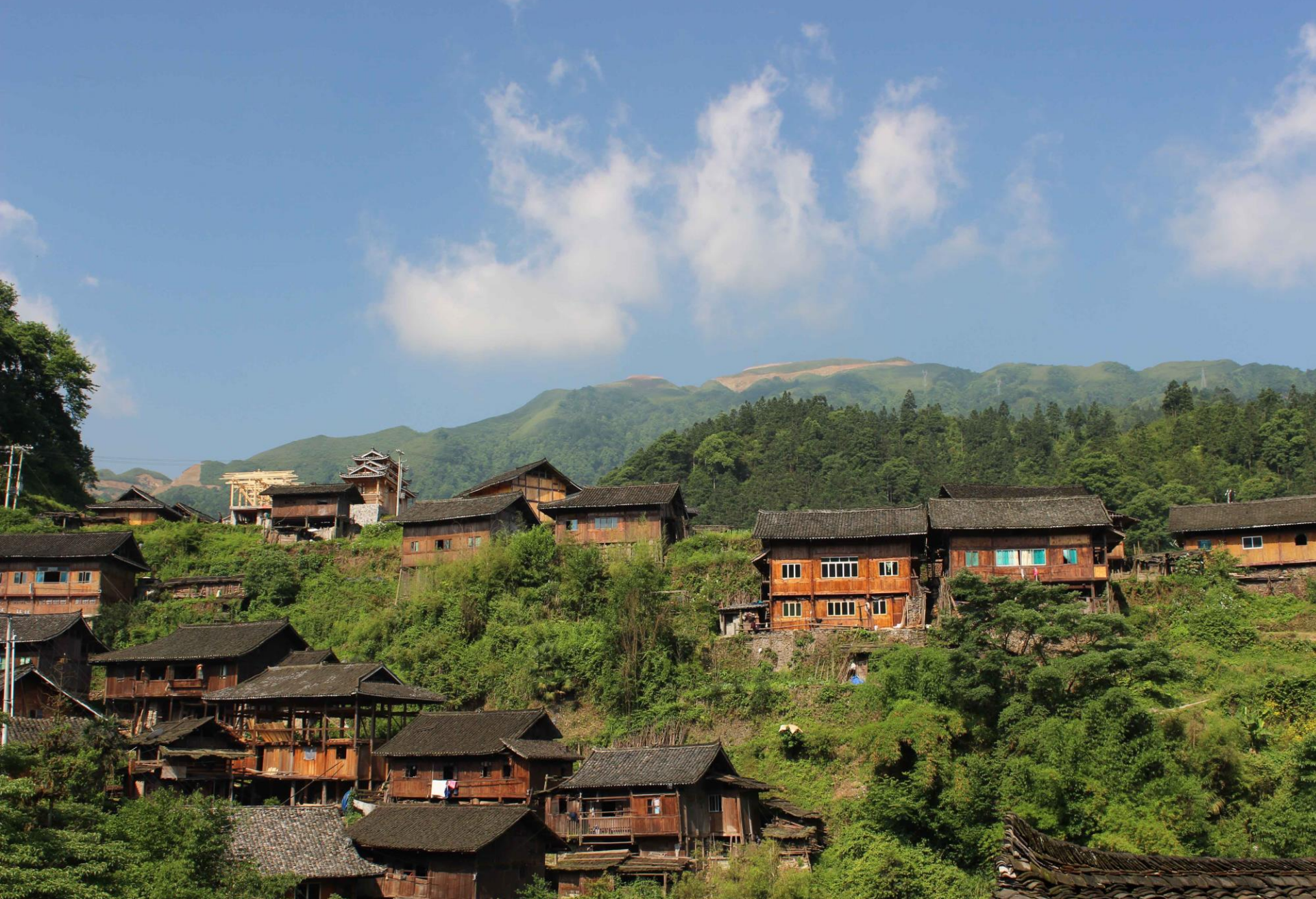
Photo 5 Houses in Da Hong Zhai Miao village