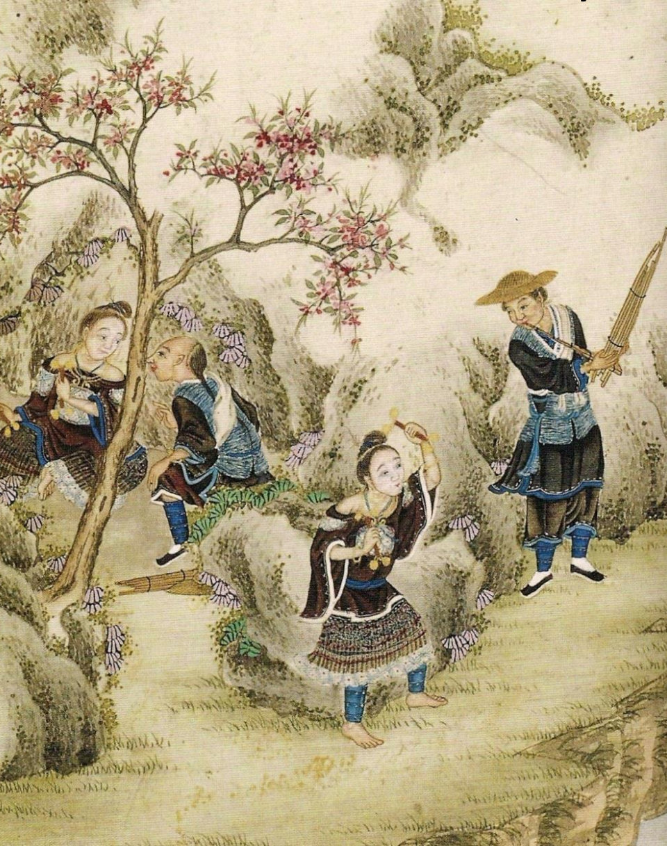
Photo 1 Tapp & Cohn 2003, plate 12 The Miao, as depicted by the Han Chinese in the 19 th Century