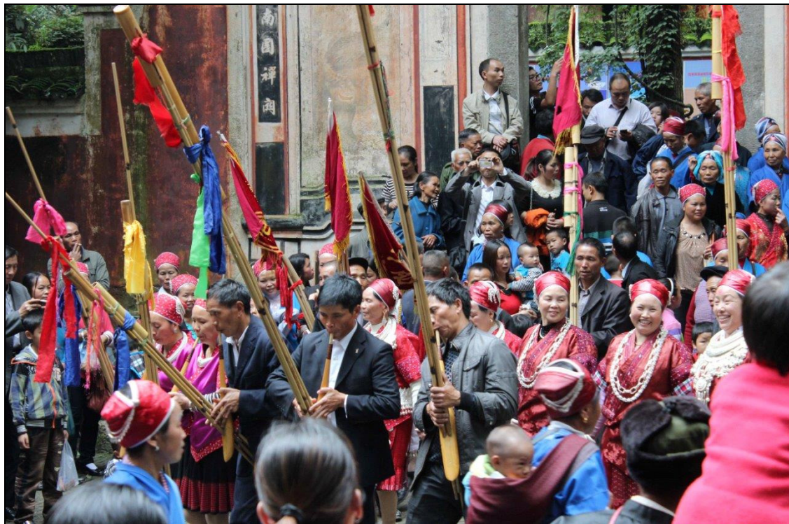
Photo 4: Huangping Lusheng Festival – notice the reed pipes called lusheng