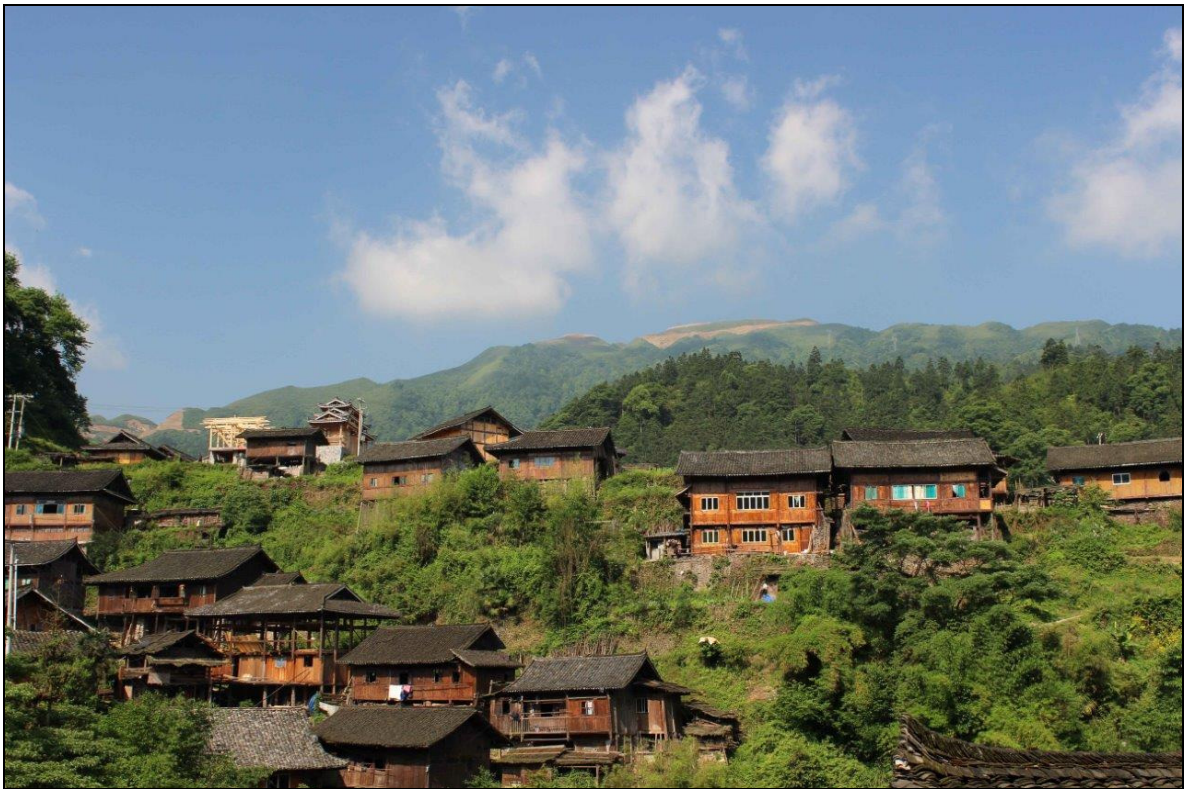
Photo 5 – Housing in Da Hong Zhai, a Hmu Miao village in the mountains of southeast Guizhou

In terms of housing, since timber is still relatively plentiful in certain mountainous regions (such as southeastern Guizhou), houses in such areas are most often built of wood, and roofed with fir bark, ceramic tiles, or thatch (Photos 5 and 6). However, in central and western Guizhou, houses are often roofed with stone slabs. Although metal roofing is no doubt used in more geographically accessible areas we have only occasionally observed this material in use in the villages visited over the last fifteen years. In central and southeastern Yunnan, houses tend to be made of reddish brick materials.