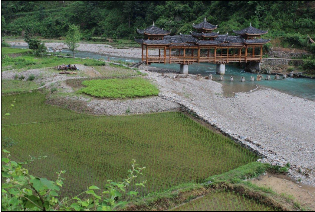
Photo 2: An agricultural landscape at Langde Hmu village in the Kaili region

There are many regional culinary variations. For example, in southeast Guizhou cooks make a sour mixture of glutinous rice and vegetables by packing them tightly into jars for up to two months. Regional culinary specialties such as this could be described for each of the many Miao sub-groups (Lee, 2005). These kinds of practices can be seen as a part of the cultural landscape on the occasion of frequent festivals where great numbers gather together in vast outdoor collective spaces. Within these spaces are created special kinds of place (e.g. food stalls, fields for bull fights, eating areas, and so on). This reminds us of the fleeting nature of some cultural landscapes, some of which exist only at certain times of the year (e.g. spring plantings, late summer harvests, musical and other specific practices depending on the nature of a given festival). The temporal dimension is an essential component in the observation and analysis of various cultural landscapes (Photos 3 and 4).