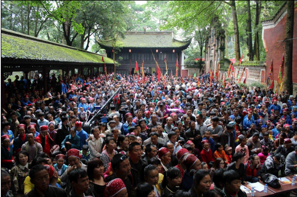
Photo 3: Huangping (Si-Yue-Ba, April 8, 2013) Lusheng (reed pipes) Festival