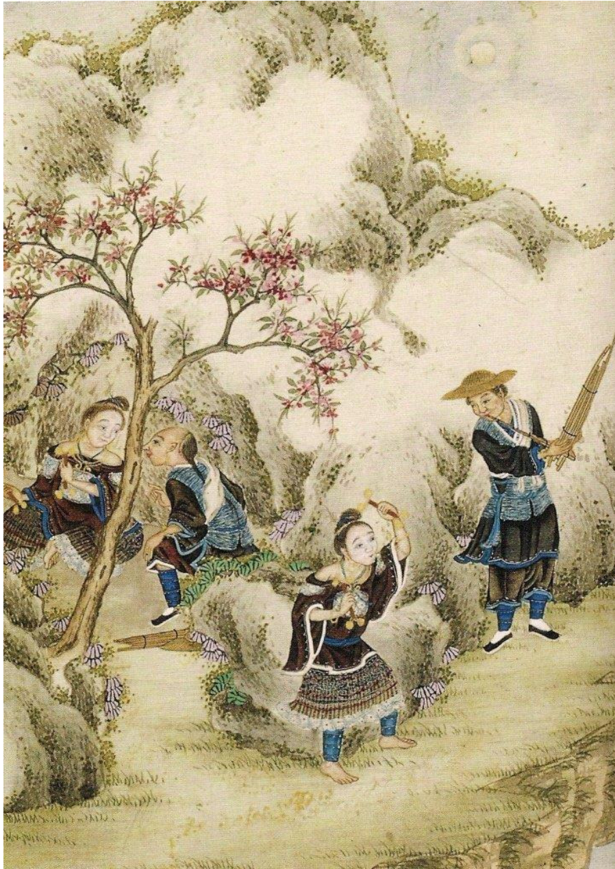
Photo 1: Plate No. 12, Tapp and Cohn (2003, 106), with permission, of the “Big Flowery” Miao (A-Hmao)

In addition to regular confrontations with the Qing (1644-1911) and the oppression to which they were subjected, the Miao had to cope with successive famines (Li, 1982). This difficult situation, which lasted right through the 18 th and 19 th centuries, incited many Miao (but only of the Hmong) to migrate towards Southeast Asia (Thailand, Vietnam, Burma and Laos) in search of a better environment for their lives. Whereas the first documented waves of these