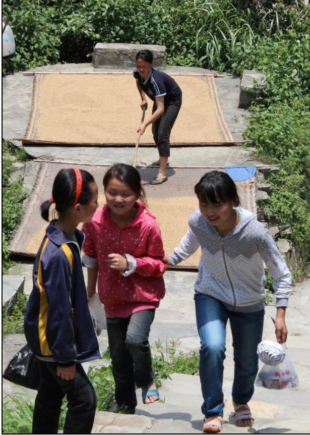
Photo 7: Pupils in Da Hong Zhai on their way home for lunch. Their school is just down the hill.

The robustness of a population is also reflected through certain aspects of the cultural landscape. With regard to health, two studies (one in central Guizhou province and the other in southeastern Yunnan have observed that rates of infant and child mortality (classic and telling indicators of health status) are alarmingly high: well in excess of 100 deaths before the first birthday for every 1000 live births (Huang et al 1997, 1031; Foggin et al 2001, 1688). The majority of these deaths during the first year of life are due to respiratory illnesses suggesting the importance of the physical and social environments to the survival of infants and children (those under 5). Further, another roughly 25 % of infant deaths are related to birth asphyxia and neonatal tetanus, which would lead one to conclude that birthing practices, in addition to the environment, are also related to these high rates of infant mortality (Huang et al 1997, 1034).